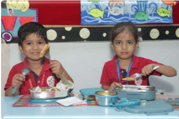
Table manners reflect politeness, courtesy, and social skills. Teaching children proper table etiquette is an invaluable life lesson that will serve them well as they play a crucial role in social interactions and relationships.